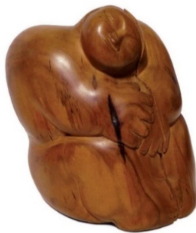
Figure 3. The sculpture of Ida Bagus Njana

Along with Lempad, the work of the late Njana evoked a specific concept related to this process: ape ade anggo (whatever is available in front of us, that is what we are going to use as an artwork). Thematic visualisation also inspired the work of Njana. The figures displayed in his sculptures adapt to the natural shape of the wood in front of him: if the available wood was large, the statue was adjusted to the anatomical shape of a human body at a larger scale. If the available wood was small and long, the resulting sculpture was a very thin and long statue, but the anatomical structure of the human body was perfectly visualised (Figure 3).