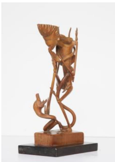
Figure 4. The sculpture of Ida Bagus Njana

Lotring, a gamelan teacher and composer, presented patterns of kotekan (interlocking figurations) and unique or distinctive melodic progressions that are believed to have never been heard before. Lotring also proclaimed himself as the first composer for Balinese gamelan in the 1930s—something that individual composers had rarely done prior to him. Most of Lotring’s compositions break the pakem (musical rules) of the traditional pieces, such as the pakem of legong (a court dance tradition) and lelambatan , (a traditional temple music), into a more expressive form and non-restrained melodic progressions in a free style. The structure of the pieces and melodic patterns from Lotring’s compositions are mostly flexible with unpredictable dynamic and tempo changes, and the application of some odd meters in some transitions of the pieces. Because of these innovations, Lotring became a composer whose works have so far been respected not only in Bali, but also internationally.