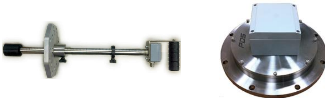
(a) (BSS Hochspannungstechnik GmbH 2017)

Several designs of the antenna have been proposed by researchers as the PD UHF detector. It includes monopole, dipole and broadband dipole, loop, fractal, a patch antenna and several other designs. Industry players also have come up with a commercial-grade UHF detector. There are two common types of detectors: a drain-valve antenna (BSS Hochspannungstechnik GmbH 2017) and dielectric window antenna (Power Diagnostics Service Co. Ltd. n.d.). Whilst the former can be driven through the standard drain valve, the latter needs a dielectric window which most probably needs to be retrofitted. Basic designs for the drain-valve antenna are a short monopole, plate, conical or any other design suitable inside a drain valve (Sinaga, 2012). For dielectric window antenna, it usually takes planar shape such as microstrip sensor, log-spiral, spiral or fractal (Sinaga, 2012). Figure 1 below shows examples for both commercial antenna types. The drain valve in the example has an insertion depth of 450 mm and ingress protection (IP) class of 65. While the dielectric window antenna has an IP 67 for its external connection box.