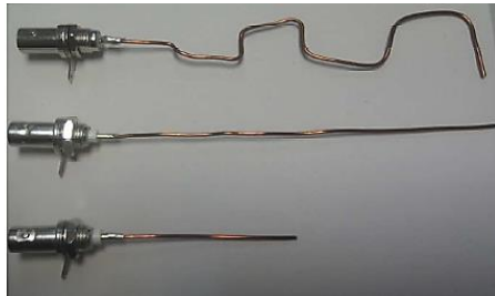
(a) From top, zig-zag antenna and monopole antennas with length variants (Robles et al., 2012)

The following Figure 3 shows examples of physical antennas that have been applied in several research. These antennas were either constructed by the researchers themselves or acquired from the market.