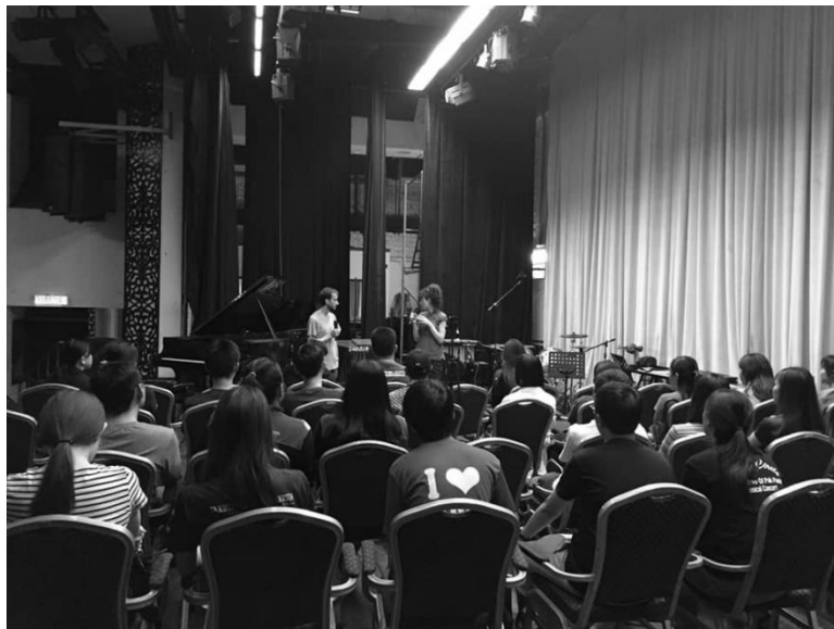
Figure 5. Image of running workshop on stage with presenters and musical instruments in front of participants