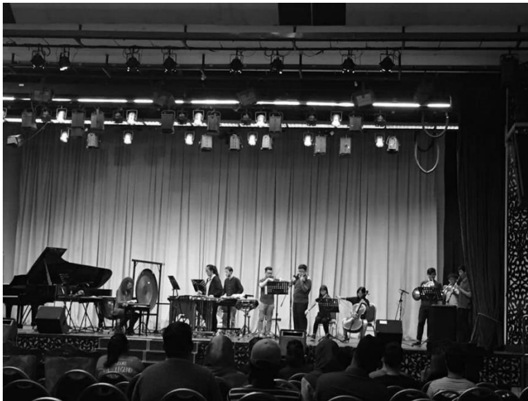
Figure 6. Concert with Passepartout Duo

Audiovisual recordings of the full concert and also of the whole two-day workshops were recorded and archived for future reference and documentation for the participants, department and faculty. For new composers, audiovisual recordings of their musical compositions are important for them to build presence online through Youtube for example, and also when applying studying programs in future. Photographs of composers, performers, and participants of both workshop and concert were taken and duly recorded for future educational or promotional purposes.