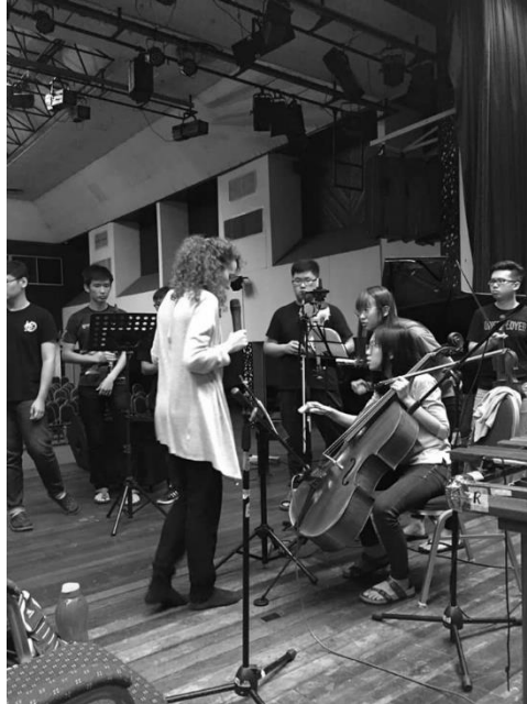
Figure 3. Group hands-on activity