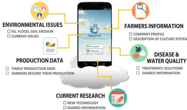
Figure 2: Proposed mobile application design for aquaculture management system

community to locate the aquaculture sites. Other than that, criteria index of aquaculture companies will obtain by using classification and grading of aquaculture company that complies with the certain standard. Furthermore, the application has unique criteria that none of the aquaculture application provides the feature of Halal aquaculture companies directory that implement Halal aquaculture produce that might give great impact and transform the Halal aquaculture industry in Malaysia. Finally, the application also provides marketplace features that give advantages to exporters and aquaculture community.