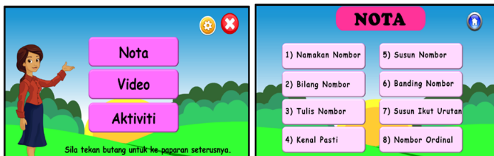
Figure 2 : Interfaces of MCDys

The teaching facilitators usually cover the curriculum, teaching results, distribution process and test processes (Abd Latih & Wan Ahmad, 2018). This phase contains two segments which are summative and formative. The overall efficiency of the directive is assessed and is generally assessed following the initial version of the instruction and generally after the initial version has been enacted. During and between stages, formative evaluations are continuous (Abd Latih & Wan Ahmad, 2018). Figure 2 and Figure 3 show the interfaces of the courseware and the example of the activities.