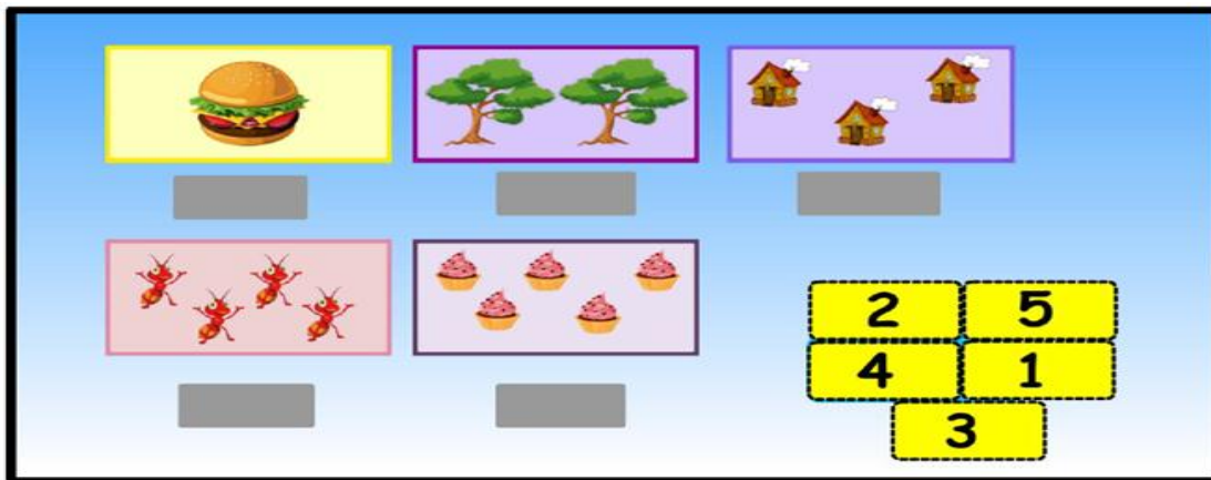
Figure 3: Drag and Drop Picture Activity