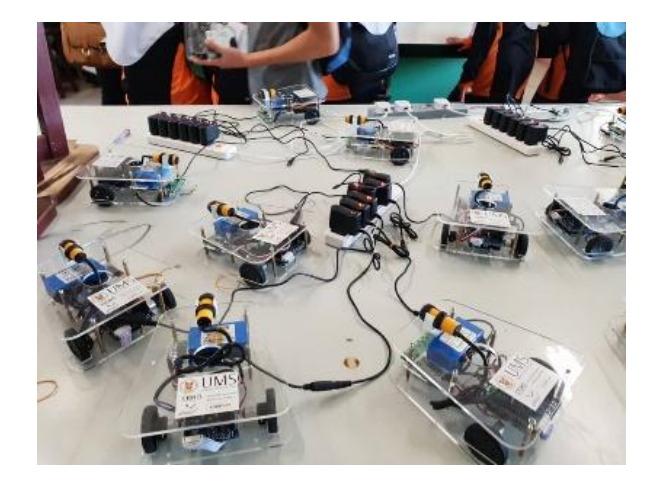
Figure 1: The Minimalist Robots 'Comel' that Are Used Throughout the Minimalist Robot Education Programme