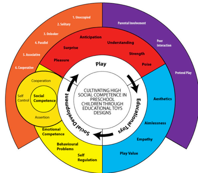
Figure 2: Conceptual Framework of Play, Educational Toys and Social Development

Therefore, the authors arrived with a proposition of the applicable design concepts (pretend play, parental involvement, peer interaction) in educational toys designs which can cultivate preschool children to have a better social competency (social cooperation, self-control, assertion) through cooperative play (see Figure 2). The figure shows the components and the subcomponents of the overlapping keywords to identify their relationships in terms of design considerations. The link is being made to determine the relationships of social skills learning, elements of play and the theories of educational toys designs. This will further serve as the guideline in setting up the future research methodology design.