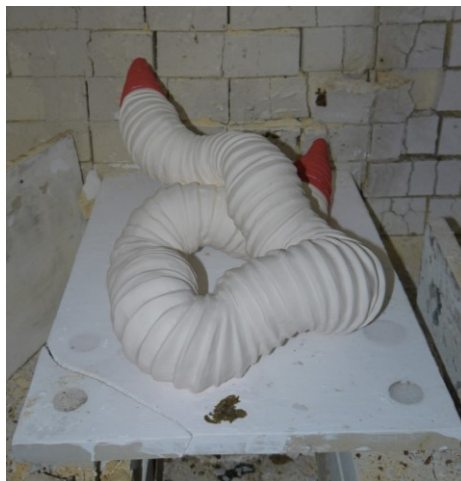
Figure 3: Ceramic firing process

The new material development involved two forming substances (hybrid materials) and one supporting substance. The two forming substances are clay slip and fabric (fiber). The supporting substance is made out of a combustible material such as foam (pool noodle) and cardboard. These two forming substances are imperative for the studio project that has progressed the expected outcome. The hybrid materials of the clay slip and fiber created the parallel sculpture's method much like the flute toy. The supporting substance has reinforced the hybrid materials to keep in form and would burn off in a high temperature of a ceramic firing process (Figure 3). The sculpture was unglazed to attain the metaphor of the artwork conceptual approach.