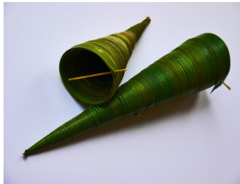
Figure 1: Flute toy made of coconut leaves

influences. Then, the third phase is forming the method development and the fourth phase is maquette creation and analysis. The final phase is the fabrication of sculptures.