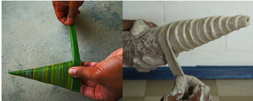
Figure 2: Intertwining Method

The new material development involved two forming substances (hybrid materials) and one supporting substance. The two forming substances are clay slip and fabric (fiber). The supporting substance is made out of a combustible material such as foam (pool noodle) and cardboard. These two forming substances are imperative for the studio project that has progressed the expected outcome. The hybrid materials of the clay slip and fiber created the parallel sculpture's method much like the flute toy. The supporting substance has reinforced the hybrid materials to keep in form and would burn off in a high temperature of a ceramic firing process (Figure 3). The sculpture was unglazed to attain the metaphor of the artwork conceptual approach.